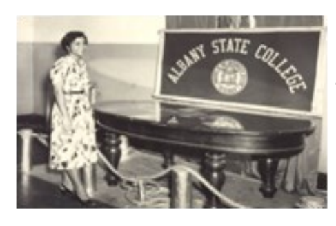
The Founder's Table