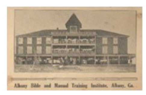
Albany Bible and Manual Training Institute