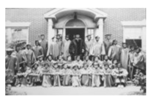
The Graduating Class of 1938